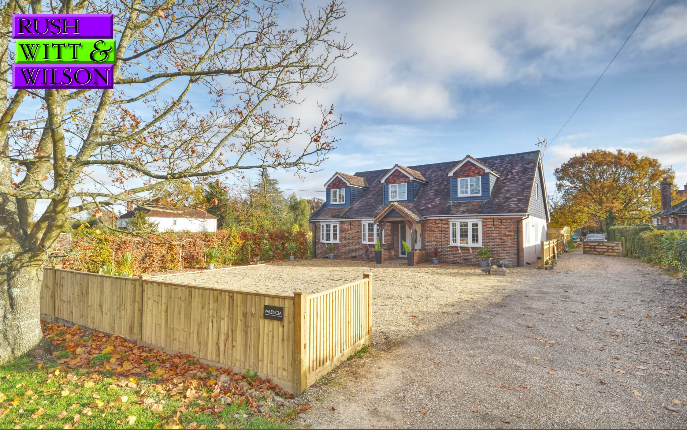
Valencia, Station Road, Northiam, East Sussex, TN31 6QL. £750,000 Guide Price